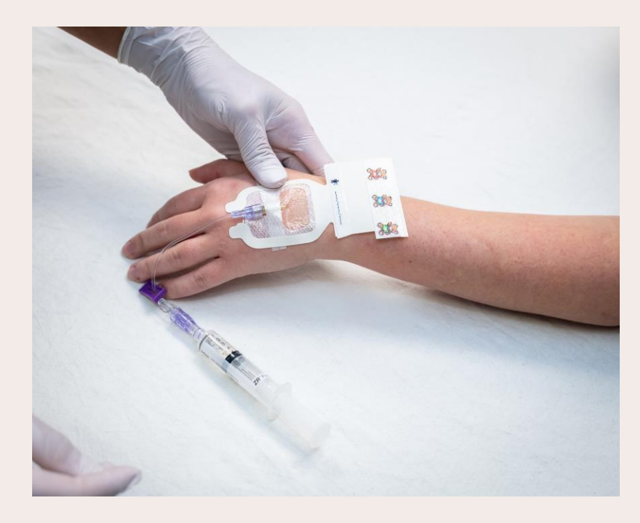
Before you go home, the IV will come out, but until then make sure you don't pull at it or take it off yourself.