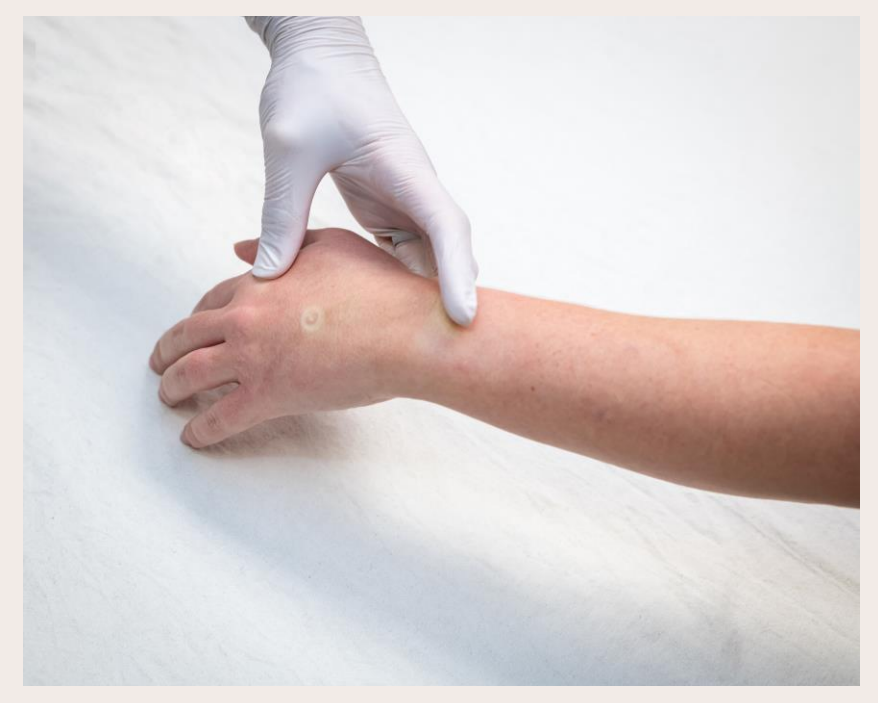
Your nurse or child life specialist can tell you when the sound is coming!

This little dot is where the numbing medicine is on your hand.