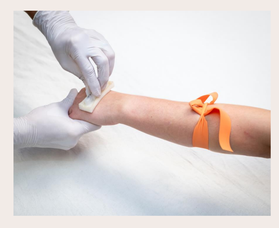
Next, the nurse will use a sponge on your skin to help keep the germs away.