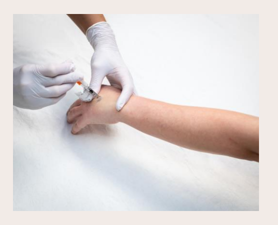
This is called a J-tip. It is a type of numbing medicine. It will help you not feel the poke as much. This is not a shot!