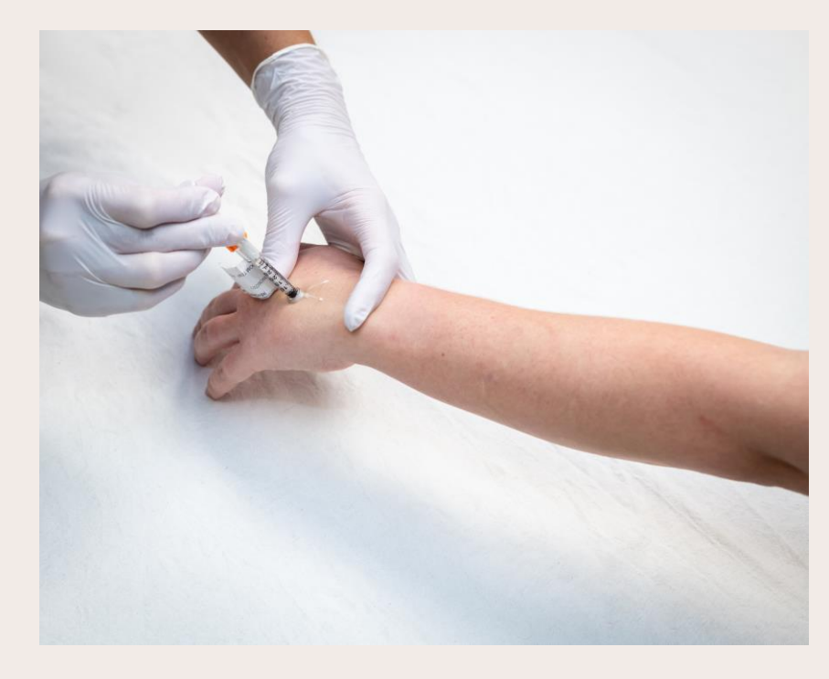
The J-tip will splash onto your skin. The medicine makes a loud noise, like opening a soda can, but should not hurt.