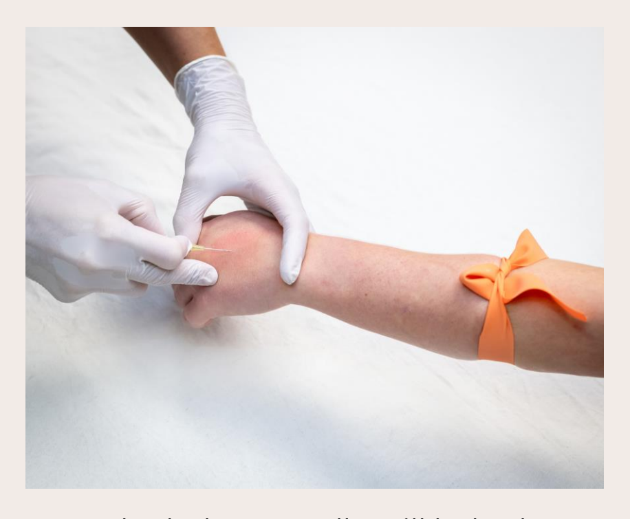
Next, the helper needle will help the IV go in the right place.

Remember to take deep breaths and hold your arm still!