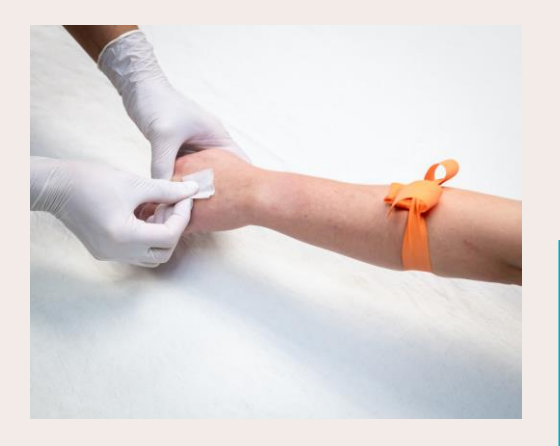
Next, the nurse will clean your hand/arm with a wipe that looks like this. Using this wipe helps keep the germs away.