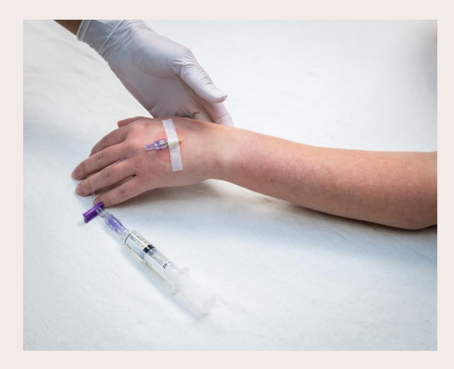
Last, the nurse will put tape/stickers on your hand/arm to hold the IV in place.

Some kids say it feels cold or "weird" going in. Other kids say it tastes or smells salty.