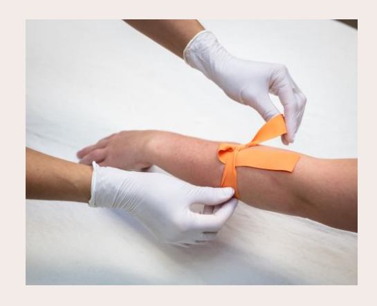
First, the nurse will tie a rubber band on your arm called a tourniquet. This helps them to see your veins better because it squeezes your arm and makes your veins bigger.