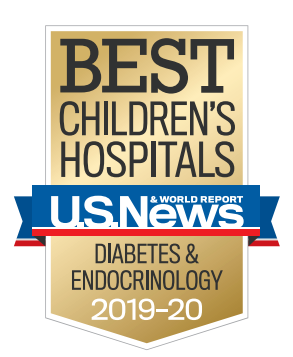
Ranked No.18 by U.S. News & World Report for Pediatric Diabetes and Endocrinology